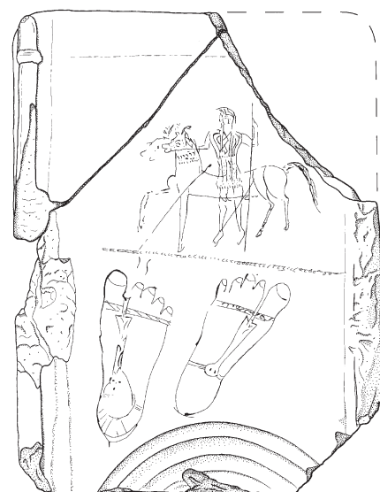
Figure 8 The roof tile with incised designs from Poșta (drawing by Frances Saxton)

pottery, coins and glass. Once the roof tile had been removed part of a structure was revealed which consisted of parallel walls with outer buttresses. It would appear