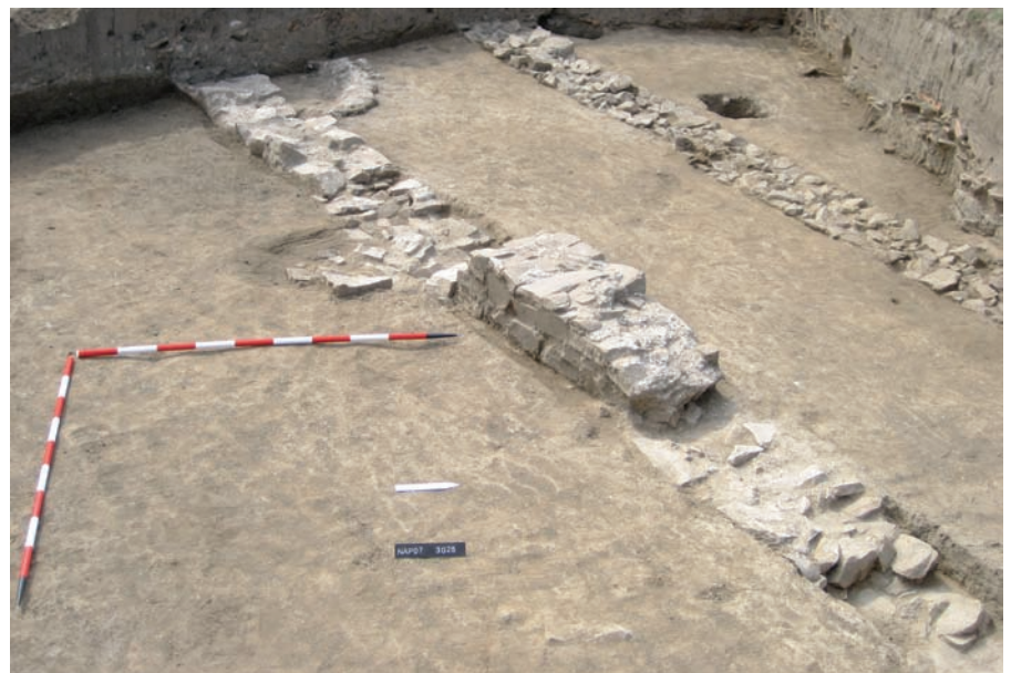
Figure 9 The probable granary at Poșta

that this represents a granary of a hitherto unsuspected military supply base (Fig. 9).