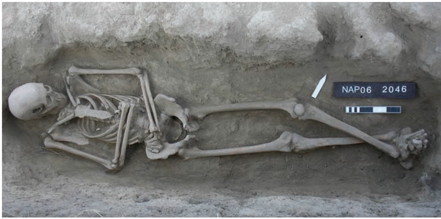
Figure 6 Late Byzantine burial from Area 2