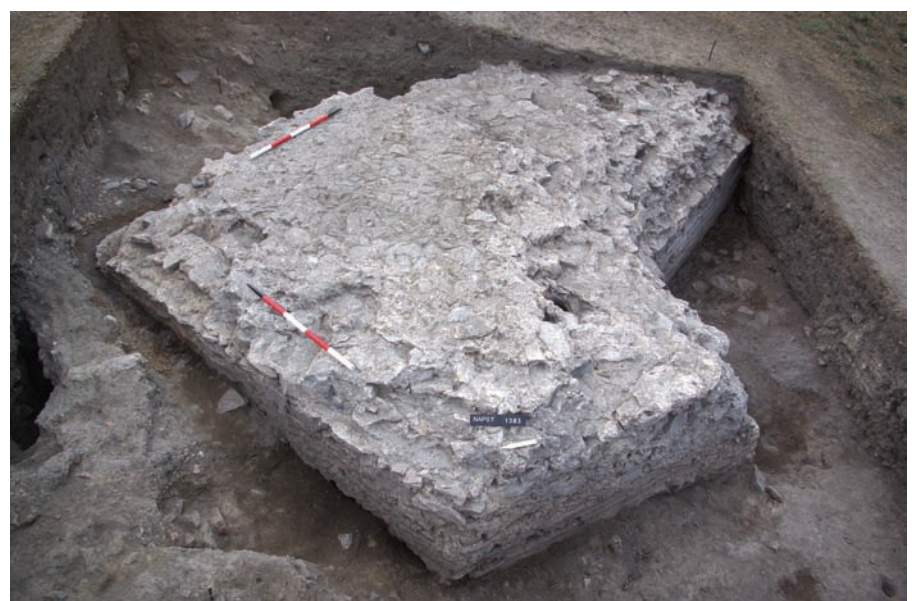
Figure 5 The entrance or tower in Area 1.7