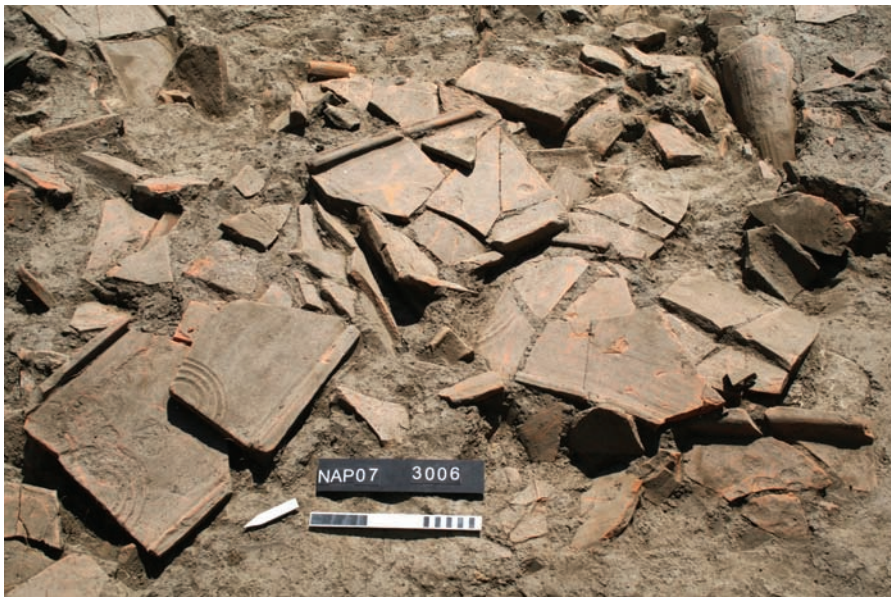
Figure 7 The collapsed roof of the probable military granary at Poșta

from the Fifth legion Macedonica and one tile was stamped by the Roman fleet based at Noviodunum. These tile stamps nicely date the structure to the first half of the second century, a date reinforced by the