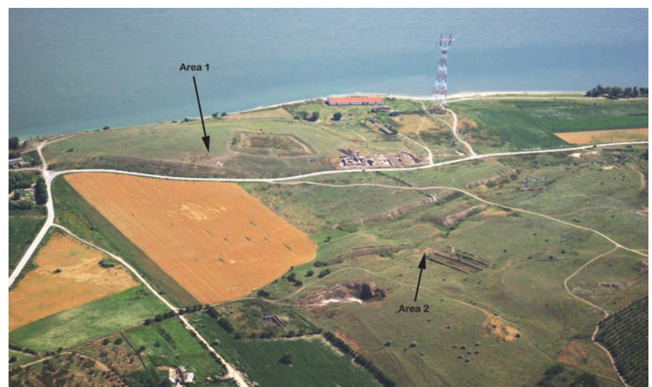
Figure 2 Aerial photograph of the site