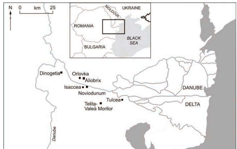
Figure 1 Location map of Noviodunum

Due to funding restrictions, the original resistance survey was undertaken in the summer when the dry soil conditions were poor for this type of survey. We had