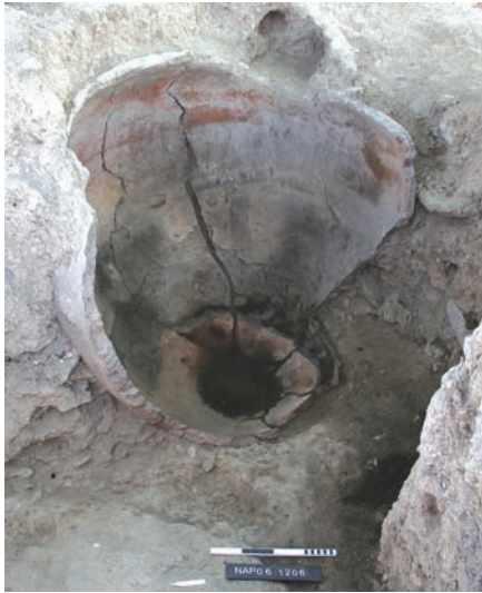
Figure 3 The dolium in Area 1 in situ

an opportunity to repeat the survey at Easter 2006 and the results were much clearer showing several breaks in the inner of the two defensive walls (Fig. 4). As a result, several test trenches were opened up to examine the nature of these breaks. The majority clearly represented robbing of the wall either in antiquity, the Middle Ages or the recent past. One trench, however, Area 1.7, revealed a faced edge to the wall which could be the entrance to a tower, or a gateway through the wall (Fig. 5). This area was expanded in 2007 and 2008, revealing reused masonry in the wall ( spolia ), as well as surviving ashlar masonry. In the later Byzantine period a small metal working workshop was set up in the lee of the wall.