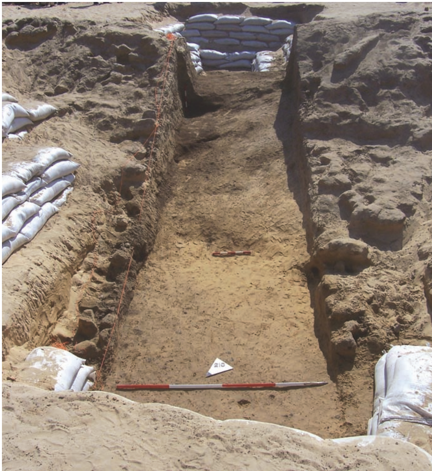
Figure 5 Section through the collapse of the Ptolemaic Anoubieion temple wall, showing sand and brick deposits

occupation in northern Egypt, which are conspicuously few or are absent, especially on the west – or are presumed to be so: the possibility that they are simply buried beneath subsequent sand sheets should lead to more attention being paid to these areas.