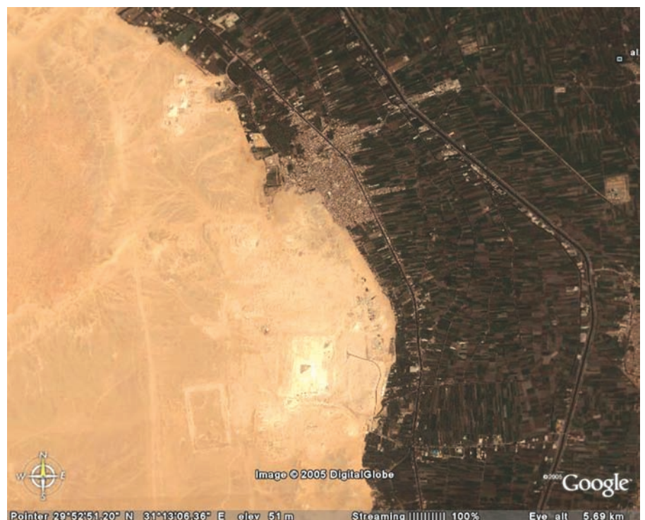
Figure 2 Satellite image of the Saqqara necropolis showing the Step Pyramid (centre) and the Abusir pyramids (centre top). Recent work has been concentrated in the valley E of the necropolis.