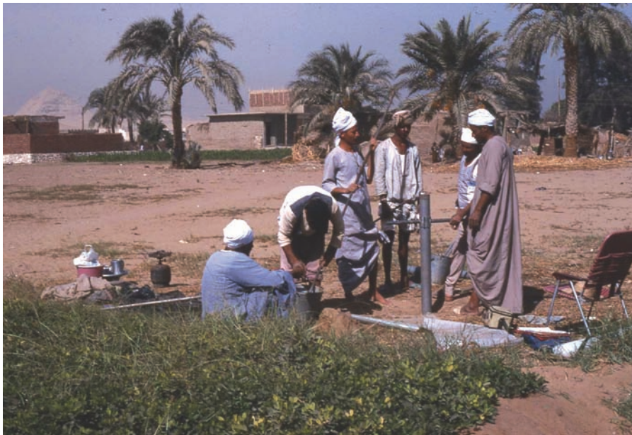
Figure 3 Sediment coring in the Nile Valley close to the Abusir pyramids (visible in background)

the Sixth Dynasty (c.2300 BCE), perhaps shifting in response to changing climatic conditions. Only at that time does the location of pyramid sites stabilize, and it is unlikely to be a coincidence that this happens closest to the eventual, later dynastic conurbation at Mit Rahina.