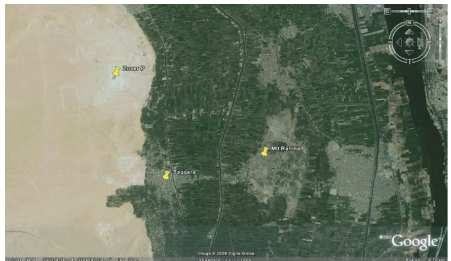
Figure 1 Satellite image showing the location of Saqqara and Mit Rahina, traditionally thought to be the location of Memphis.

five thousand years to the eastern side of the floodplain, and today flows close to the older rock and gravel strata of the eastern (Arabian) desert (Fig. 4). The dynamics behind this long-term shift are still not perfectly understood: there are probably multiple causes, such as aeolian sand deposition in the west from the Old Kingdom (2500 BCE) onwards, and the formation of alluvial sand and silt islands as part of the natural Nile regime, perhaps enhanced and augmented by human activity such as the construction of moles and earthworks to protect existing settlements from erosion.