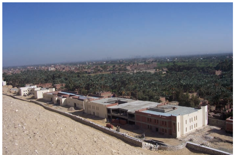
Figure 6 View looking north over the Nile Valley towards Cairo, showing new construction

At present we are particularly interested in the possibility that the later dynastic centre, around the town of Mit Rahina, was founded on a natural sand dune ( turtleback ). Here our sediment cores show archaeologically sterile coarse sand deposits at a fairly uniform depth of five metres below ground level (15 metres above sea level). If, as we suspect, the area around the modern town became the core of the city for the rest of its occupation history, then a natural sand formation presenting dry land above the floodplain and the reach of floodwaters could have been an irresistible target for settlement as