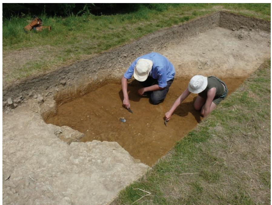
Figure 4 Exposure of fissure fill in 2008

Beyond clearing up a century-old mystery, the new work at Beedings is immensely important for at least two directions of current Palaeolithic research. First is the vexing question of attribution surrounding the LRJ itself. The technology represents the first appearance of blade technology