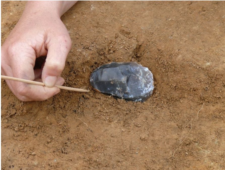
Figure 5 Upper Palaeolithic blade core under excavation

in northern Europe, predating by several thousands years the Aurignacian industries which are often seen as the signature of the appearance of anatomically modern humans on the continent. Its early appearance has led to speculation that the makers of this efficient and deadly hunting kit were the last Neanderthal population of northern Europe and that prior to extinction they were independently evolving a technologically advanced approach to tool production, an approach which is still often considered the preserve of our own species. While considered highly probable, the case for Neanderthal authorship of the LRJ still has to be formally proved through closer dating of human occupation patterns in the Mid-Devensian within Northern Europe. From the Beedings excavations we now have a dataset which can ensure the site becomes central to this primary research question.