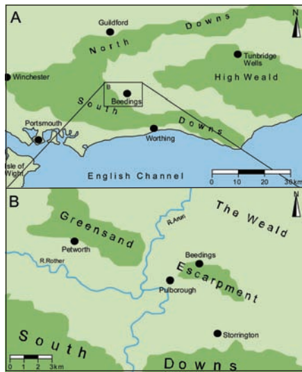
Figure 1 Maps showing location of Beedings

In 1900, the building of an imposing turreted house named Beedings was undertaken upon retirement by the physician John Harley (Figs 1 and 2).