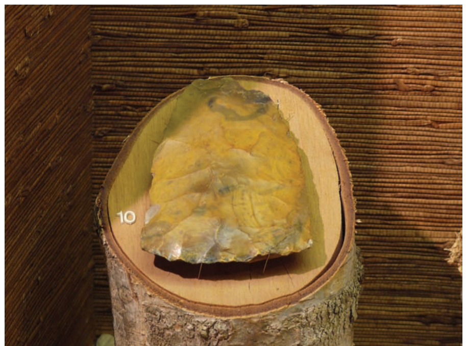
Figure 6 Mousterian (MTA) biface from crest of Wood Hills, 1km to the east of Beedings

Two sites, both discovered and recorded in the 19 th century, indicate the potential value of the resource. In 1827 the first hints of the potential of these sites was noted after the discovery of Pleistocene fauna including hyena, horse, rhinoceros and mammoth within fissures at the site of Boughton, to the south of Maidstone in Kent. 4 Described originally as caverns, but in reality pipes and fissures of varying size, they contained fine-grained deposits and are a widespread subsurface feature within the Kentish rag beds of the Lower Greensand around Maidstone. In the late 19 th century the wider prevalence of fissure sites was demonstrated at a