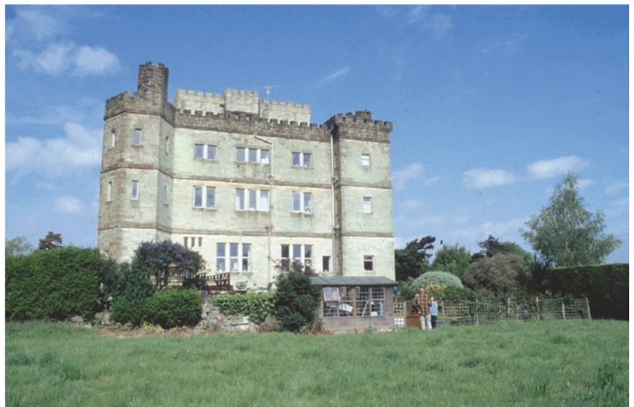
Figure 2 “Harley’s Castle”, the monumental house of Beedings, built at the turn of the 20th century

The defining artefact of the LRJ is the blade point, manufactured on substantial, triangular cross sectioned blades struck from opposed platforms cores (Fig. 3). Secondary retouch, which is regularly present on both dorsal and ventral faces, was aimed at straightening and thinning the pieces, presumably for hafting as projectile points. Further evidence for use as projectiles was identified by Jacobi through the recurrence of broken elements, some times refitting, which exhibited features of impact damage. Some of these broken elements had been recycled into other tool forms including end-scrapers and burins, leading Jacobi to speculate that the site represented a hunting station where kit was maintained and repaired while the Wealden plain was observed for game. 3 Excavations by Jacobi and Con Ainsworth in 1985, which followed recognition of the site's importance, failed to find any further trace of the Palaeolithic whatsoever and here the matter rested: the late but welcome recognition of the site as representing a hunting camp from the earliest Upper Palaeolithic, although apparently lost to archaeology.