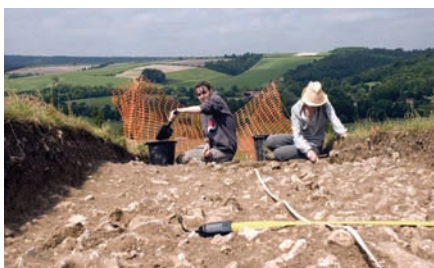
Figure 8 Students excavating trench 2 through a Bronze Age lynchet at Little Combes, May 2007.