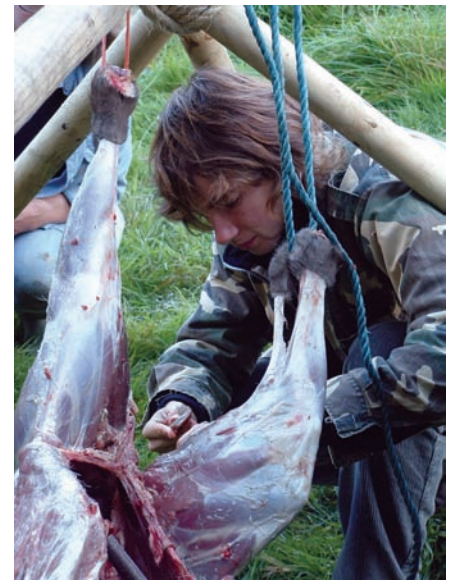
Figure 3 Experimental archaeology course 2005: using flint to butcher a deer.

Batten Hanger was first excavated by the Chichester District Archaeological Unit under John Magilton between 1988 and 1991. The later phase of the villa