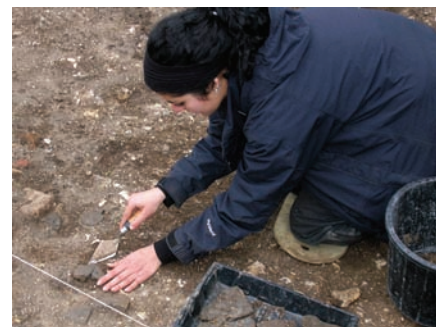
Figure 5 Recovering a Rowlands Castle type jar during excavations at Batten Hanger.

The later prehistoric use of this landscape is well attested with Bronze Age barrows and occupation sites and Iron Age hill enclosures; however the dating of some sites such as the Goosehill enclosure and of widespread features such as cross ridge dykes is ambiguous. During May 2006 we started our landscape survey to characterize some of these features by looking at the land immediately to the south of West Dean College. David McOmish (English Heritage) helped to train some of our students in topographic survey by looking at the slopes below the Trundle (where a Neolithic causewayed enclosure and Iron Age hillfort are located) where they identified a series of large lynchets. Lynchets are banks which are formed at the end of a field because the soil, loosened by the plough, gradually erodes down slope, stopping at the end of the field where it probably met a field boundary. We were particularly interested in this area because a number of small platforms were identified next to the lynchets. At one of these moles had revealed knapped and fire-cracked flint as well as a couple of sherds of Bronze Age pottery which led us to believe this might be a hut platform similar to those excavated by Peter Drewett at Black Patch. 4 However lynchets have been variously dated to the Bronze Age, Iron Age, Romano-British and early Medieval periods; indeed it is