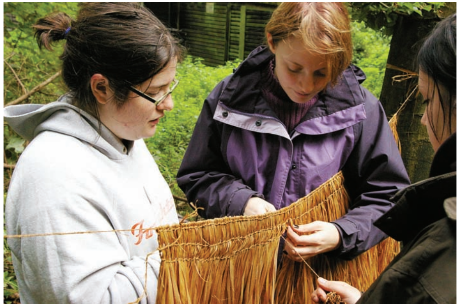
Figure 2 Experimental archaeology course 2005: tree bast skirt being prepared.

The broad research aim of the project is to gain an understanding of the area's long-term history and landscape biography (the sequential impact of human activities and natural processes and how these influence people's perceptions of the meaning and use of places). This includes both a focus on environmental history and a consideration of how farmers, craftsmen, artists and archaeologists shape our engagement with the landscape. The intention is to understand how wide regional changes in social, economic and ideological concerns are themselves constrained and developed within the specificity of the locality. A central feature of the project is the study of the materials and techniques used for the construction of buildings, boundaries, monuments and artefacts and how this affects people's experience of place and landscape. This can be considered in relation to how the choice of construction techniques and materials (e.g. earth, wood, stone, brick, or cement) change places at the time of