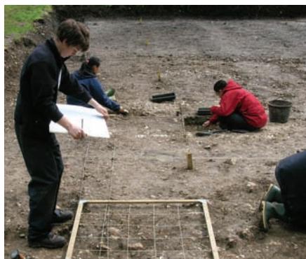
Figure 4 Excavating at Batten Hanger 2006.