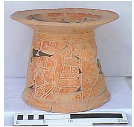
Figure 6 David Pendergast termed this form a “chalice” due to its high pedestal base. These large, elaborate vessels are characteristic of the Postclassic period at Lamanai and were frequently smashed over burials.

Goods, people and ideas moved through Lamanai in the Postclassic and the community’s richly decorated ceramics show this. Politically and economically, Lamanai was probably the capital of the region or province of Dzuluinicob in the