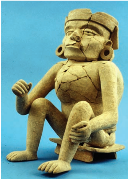
Figure 4 David Pendergast excavated this spectacular vessel depicting a hunchbacked man from one of latest elite tombs at Lamanai, probably dating from the late 15th to early 16th century.

Furthermore, it appears that most Lamanai ceramics were produced near the site, although they often resemble exotic styles. Given that most vessels were made locally, that paste and surface finish do not consistently co-vary, and that ware has been applied differently across the Maya area, I find ware more of a liability than an asset. Still, I need a way to group stylistically similar pots because this can provide clues about interaction in the Postclassic. In grappling with this problem I noticed that type-variety as originally developed in the 1950s includes two taxonomic levels designed for inter-site and inter-regional comparison: ceramic system and ceramic sphere. Oddly, the first of these has never been used in Belize.