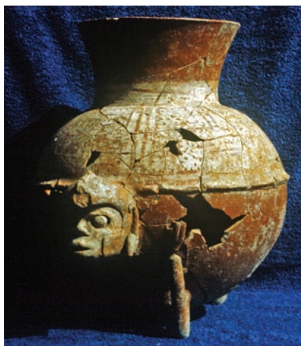
Figure 5 This vessel representing a monkey was found in the same tomb as the hunchback vessel.

Furthermore, it appears that most Lamanai ceramics were produced near the site, although they often resemble exotic styles. Given that most vessels were made locally, that paste and surface finish do not consistently co-vary, and that ware has been applied differently across the Maya area, I find ware more of a liability than an asset. Still, I need a way to group stylistically similar pots because this can provide clues about interaction in the Postclassic. In grappling with this problem I noticed that type-variety as originally developed in the 1950s includes two taxonomic levels designed for inter-site and inter-regional comparison: ceramic system and ceramic sphere. Oddly, the first of these has never been used in Belize.