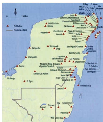
Figure 2 Postclassic period sites in the Maya area are concentrated in the northern lowlands of Belize and Mexico.

There are hundreds of abandoned cities across the Maya region of Mexico, Belize, Guatemala, and Honduras. Many of the most spectacular ones, such as Calakmul on the dry Yucatan peninsula of Mexico, Tikal in the Peten rainforest of Guatemala, and Caracol in the Maya Mountains of Belize, were indeed abandoned rapidly in the last century of the Classic period (AD 250–900). However, beginning with the Carnegie Institution of Washington's work at the