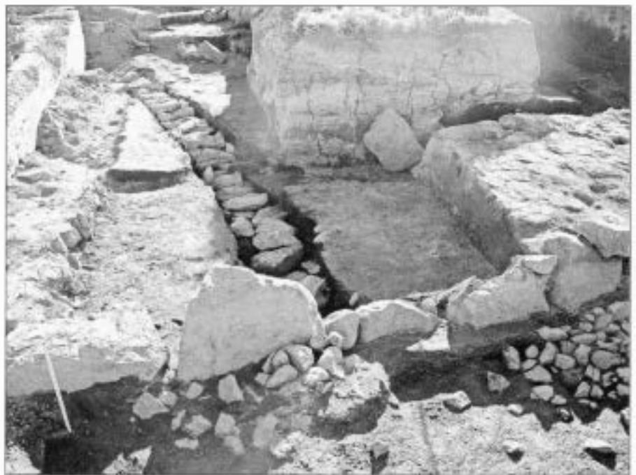
Figure 8 The (steam?) conduit, looking towards the west, showing the line of cap stones that covered it.

Reykholt is an important site that invites multidisciplinary study. Snorri Sturluson is of interest to historians and literary critics alike, and, as Reykholt was also an ecclesiastical centre, many written sources exist that relate to it. The discovery of the complex constructions associated with the exploitation of geothermal energy at Reykholt has revealed a wholly new picture of sophisticated life in medieval Iceland. It seems that Reykholt was a centre of learning in the thirteenth century, and the possibility that it was also a place for health treatment, including water and perhaps steam baths, is intriguing, conjuring up images of such institutions in the Classical world. One of the main aims of our current investigations at Reykholt is to throw further light on the use of geothermal energy at the site – a subject of study hitherto unexplored in Icelandic archaeology.