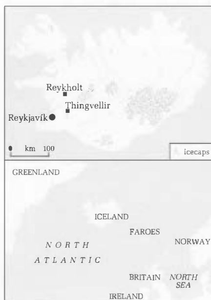
Figure 1 Iceland, showing the location of Reykholt and of the Althingi (the former parliament) at Thingvellir.

Initially, there was no central power in Iceland to execute law and keep order. The main assembly where important decisions were made, the Althingi, was established in AD 930 at Thingvellir (Fig. 1). It was attended by chieftains ( goðar ), each with authority over a certain group of farmers ( goðorð ). Power was centralized when the Norwegian king added Iceland to his realm in 1262. His attempts to do so were aided by internal strife between the handful of families in whose hands power was concentrated by that time. One of them was the Sturlungs, the family of the chieftain