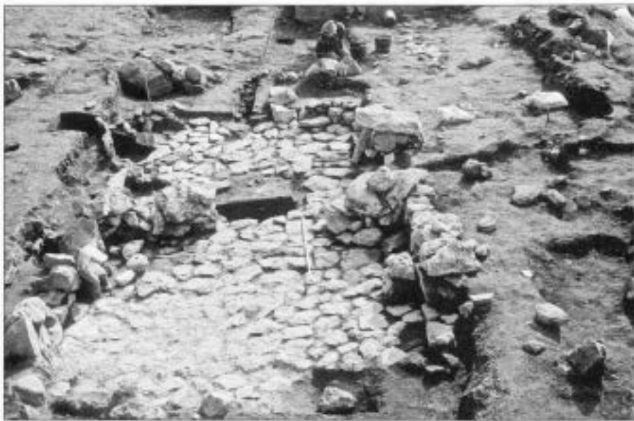
Figure 7 The foundations of the putative bath-house, looking east, before the (steam?) conduit was excavated.

hollowed-out pinewood pipes. There are also references to houses in Chaudes-Aigues being built over the spring itself and using the hot water directly below the floors for heating. There are also examples of such practice in Iceland, in the Reykholtisdalur valley. According to an early twentieth-century source, 12 a steam bath long existed at the farm known as Sturlureykir, a short distance to the west of Reykholt. It is described as being sunk slightly below ground and entered by stone steps, with a floor paved with flagstones and walls made of stone on the inside and turf on the outside. This description corresponds remarkably well to the putative steam bath excavated at Reykholt. The bath-house at Sturlureykir was said to be used for the treatment of rheumatism. Geothermal water was evidently used at Chaudes-Aigues in the medieval period for a similar purpose, a practice that goes back to the Romans and Etruscans.