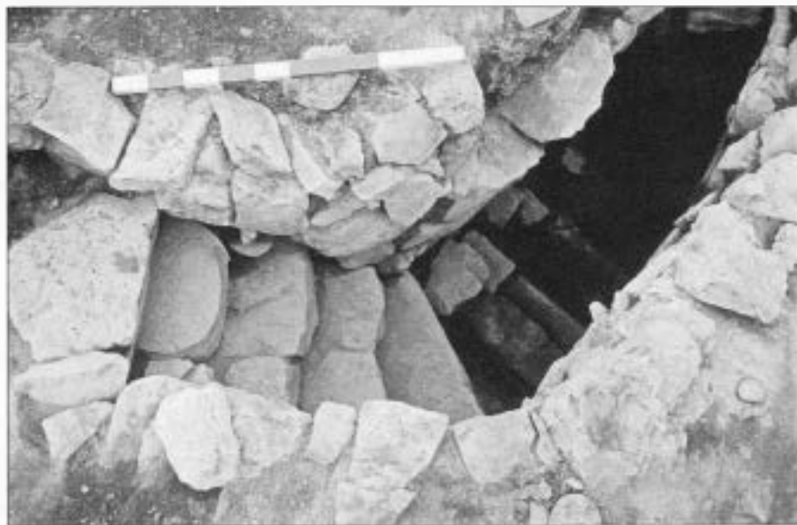
Figure 6 The stone steps at the northern end of the subterranean passageway (scale bar 1 m).

Another building of a similar date was found farther to the north. It had a paved floor and a conduit running towards it, which probably carried steam into the building from the hot spring (Figs 4, 7). The conduit consisted of a trench into which stones were placed to form a channel on average 20 cm wide, on top of which flat stones were laid (Fig. 8). The sides were packed with clay and there was turf on top for insulation. It seems probable that this paved building was a bath house. Medieval bath houses are known in Iceland, Norway and Greenland, 8 but they have wooden platforms and an oven in which hot stones were doused with water to create steam. At Reykholt the same effect would have been achieved by making use of the geothermal supply of steam or water, which may also have been used to heat the building.