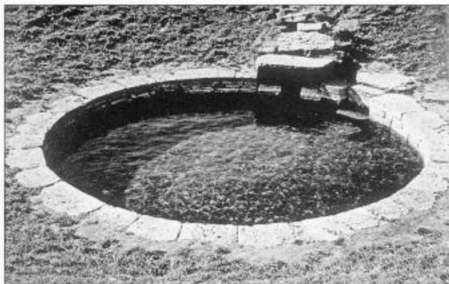
Figure 5 View northeast of the reconstructed warm-water bath Snorralaug at Reykholt (diameter of the bath c. 4 m).

a flagstone. Two conduits are known to have supplied the bath from the spring, one of which replaced the other. A third conduit was discovered in 1964 running towards the farm site (Fig. 3). It is believed to be a steam conduit that supplied a steam bath. 7 In 2001 a fourth conduit was discovered, this time within the original farm site (Fig. 4).