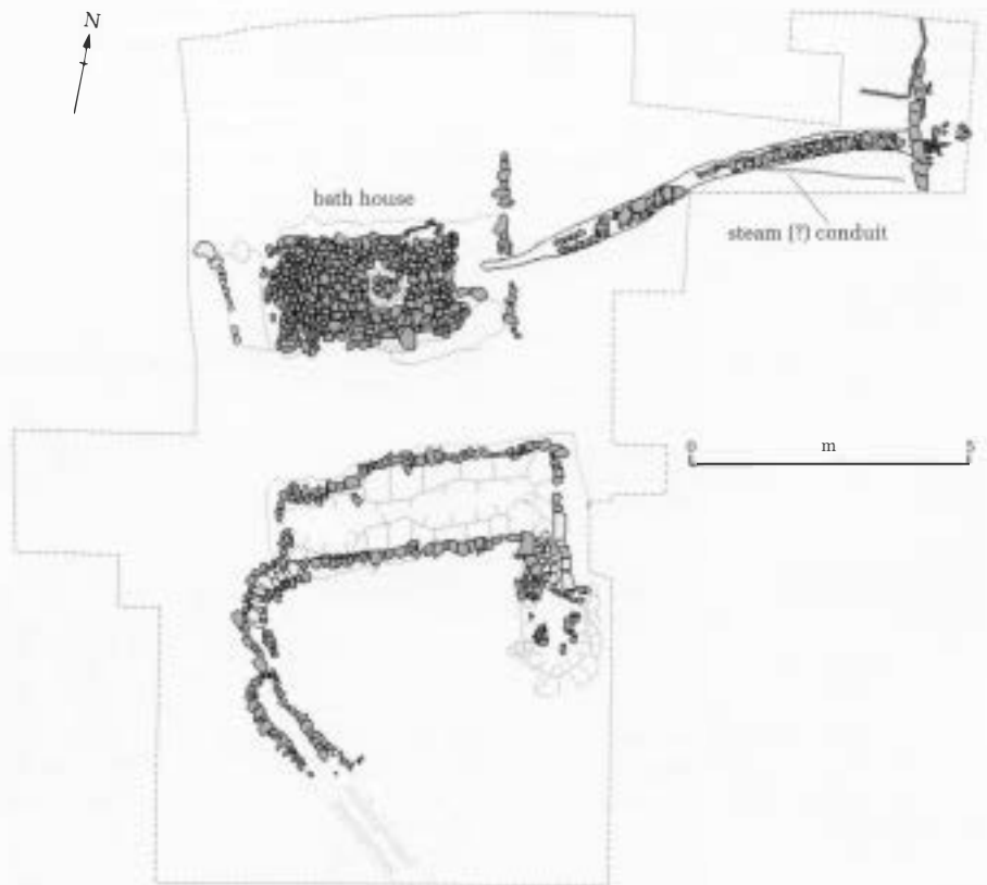
Figure 4 Plan of part of the area excavated at Reykholt showing the subterranean passageway running into a former building, and, to the north, the putative bath house and the associated (steam?) conduit.

Water was supplied from the hot spring, through a stone-built conduit in which the flow could be controlled, to a circular stone-built warm-water bath, named Snorrallaug after Snorri Sturluson, which was a little less than 4 m in diameter, with a stone ledge to sit on (Figs 3, 5). The oldest description of the bath, as it exists today, dates to 1724, but a warm bath at Reykholt is first referred to in the Book of Settlements ( Landnámabók ), 6 thought to have been originally compiled in the twelfth century. The bathwater, which emerged at boiling point from the hot spring, was cooled down by temporarily blocking the conduit, and hence the flow of water, with