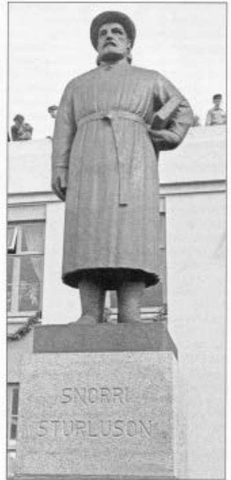
Figure 2 A statue of Snorri Sturluson at Reykholt by the Norwegian sculptor Wiegeland, presented to Reykholt by King Olaf of Norway in 1947.

At a medieval farm site in western Iceland, once occupied by Snorri Sturluson, a famous chieftain and scholar, archaeological evidence has been discovered of stone-built conduits that were built to conduct water and steam to the farm from a nearby hot spring. No other example is known of such use of geothermal energy in medieval Iceland, and multidisciplinary investigations are continuing at the site.