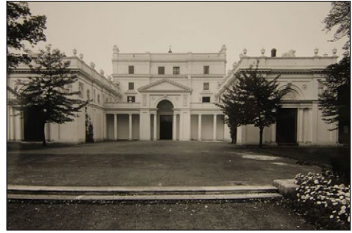
Figure 3: The Institute of Archaeology, St. Johns Lodge, Inner Circle, Regents Park.