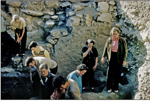
Figure 1: Kathleen Kenyon excavation at Jericho.

Using archives from the UCL Institute of Archaeology and Special Collections, this study seeks to move away from excavation-centred studies of Kenyon to shed light on her administrative career. Kenyon spent thirteen years as the Institute of Archaeology's chief administrator, as well as serving as Secretary to the Council for British Archaeology (1944–1948) and volunteering for the Palestinian Exploration Fund (1935–1955). The study will also provide a gender-critical perspective of her career within the British archaeological community and in the process, reveal the vital work done by female administrators, who took advantage of expanding opportunities in the inter-war period to carve out professional spaces for themselves. Along with them, Kenyon faced significant challenges: discrimination, calculated interference and negative character judgements that remain embedded in discourses about her to this day.