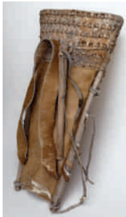
Figure 4 Cow skin carry sack from the Bronze Age salt mines

out rags, others appear to have been left in good working order; all were discarded along with piles of burnt lighting rods and other debris. Most of the skins and furs are torn and fragmentary pieces that cannot be identified to any category of