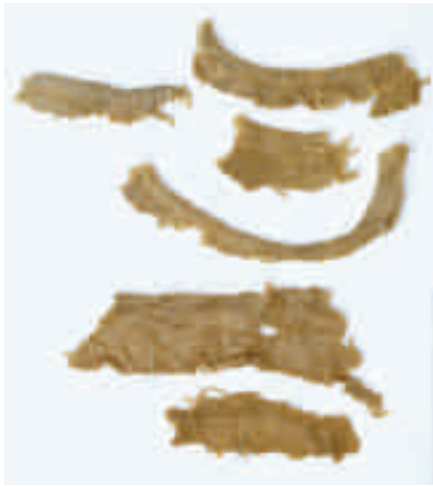
Figure 9 Textile remains interpreted as hauling sacks

same process that is carried out today to make the famous Lodenmantel which is part of the national costume of the Salzkammergut region of Austria where Hallstatt is situated.