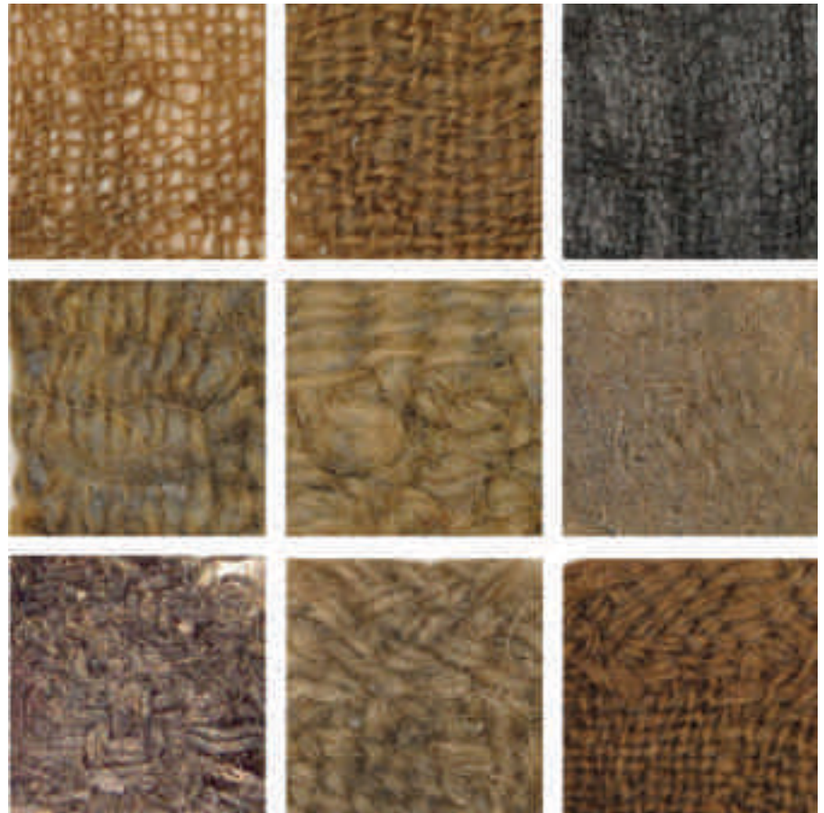
Figure 8 Bronze Age textiles showing the range of weave types