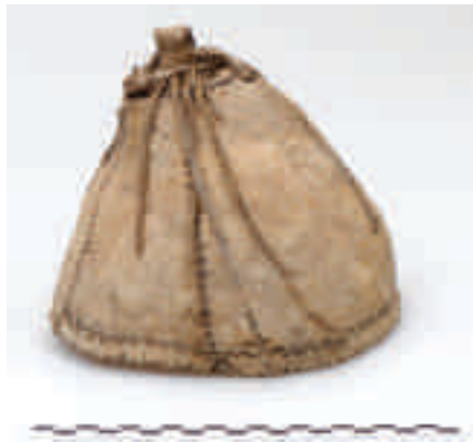
Figure 7 Fur hat (fur facing inwards) with tassel from the Grünerwerk site

object: pieces of strap, flat pieces of fur without cut edges or diagnostic features and scraps with the remains of a seam or series of cut holes.