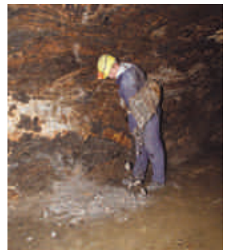
Figure 5 Reconstruction showing how the carry sack may have been used in the mines