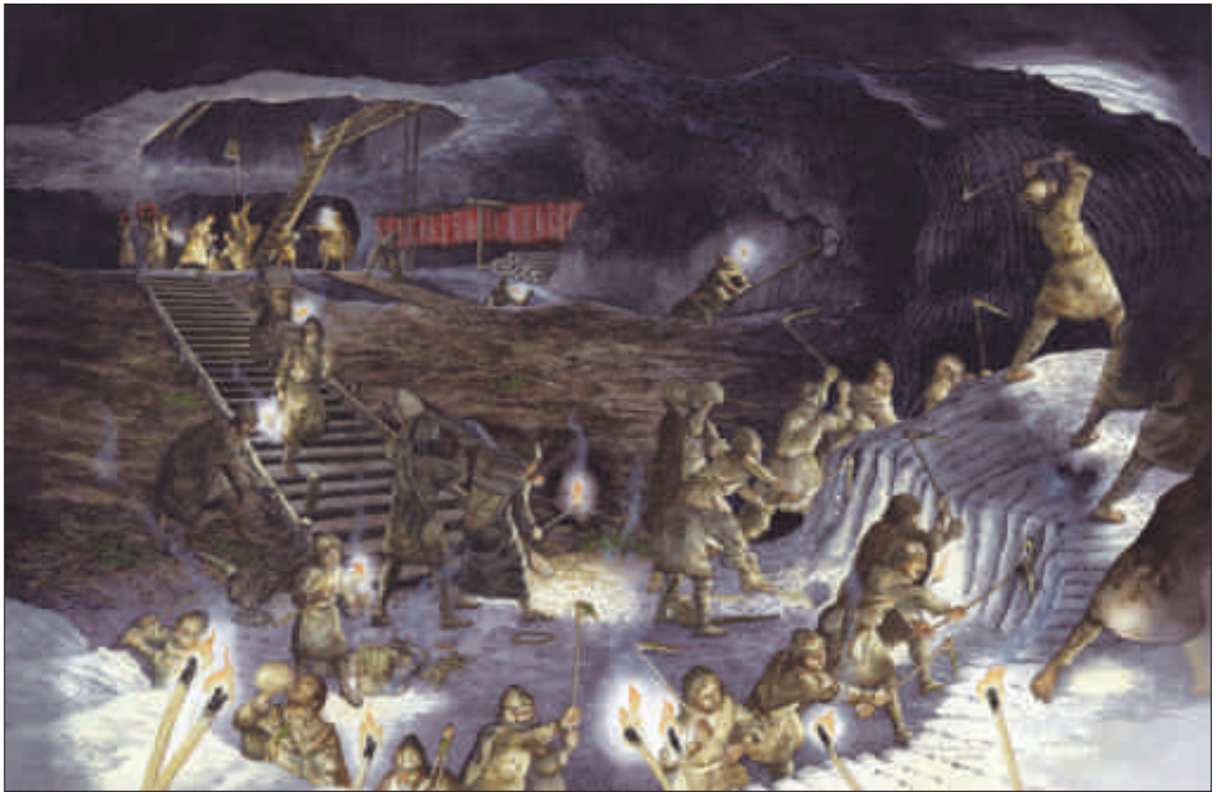
Figure 3 Visual representation of the Bronze Age salt mining in Hallstatt based on research carried out by the Vienna Natural History Museum