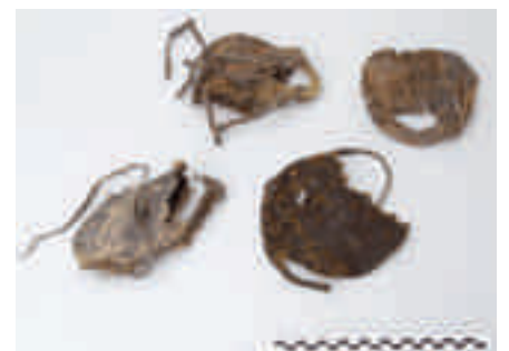
Figure 6 Hand leathers from the Christian von Tuschwerk site