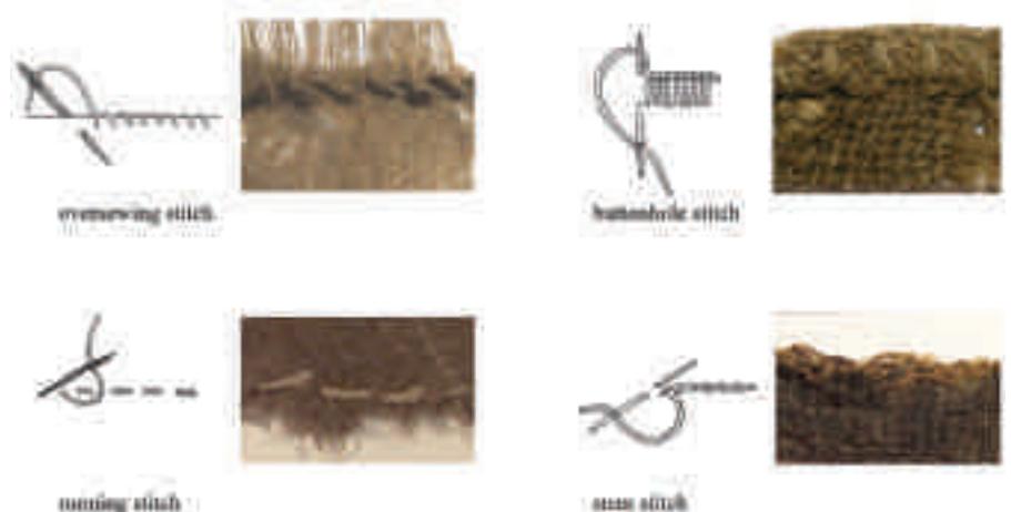
Figure 10 Stitching types from the Bronze Age mines