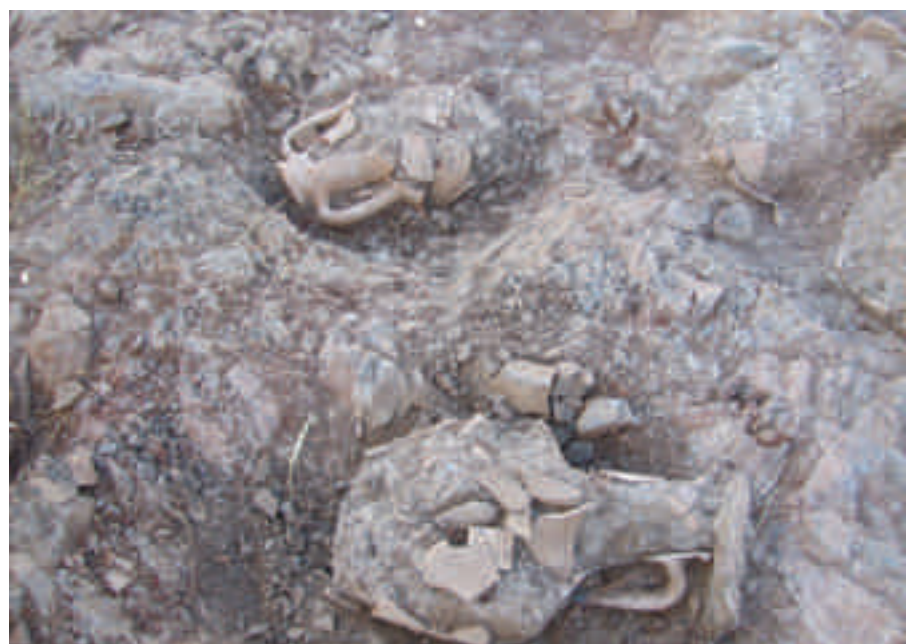
Figure 6 Pots lying in situ at the Kylindra infant cemetery

The large number of infants discovered at the Kylindra cemetery make it possible to study the variation of growth and development within different part of the skeletons. Standards derived from the development of modern children yield a scale against which the Kylindra skeletons can be compared. The teeth, long bones and base of the skull are the most useful parts of the infant skeleton for this (Figs 9 and 10). 5 Their measurements suggest that the great majority of infant remains represent full-term babies dying around the time of birth, but some are much smaller, suggesting they were born pre-term and others are much larger, suggesting they survived for at least a few