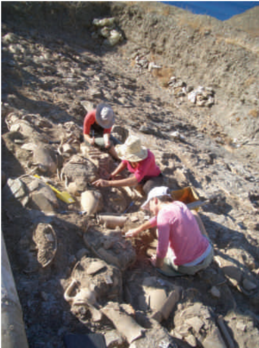
Figure 5 Excavations at the Kylindra infant cemetery

remains were too fragmentary and lacked any elements to indicate that more than one adult was present.