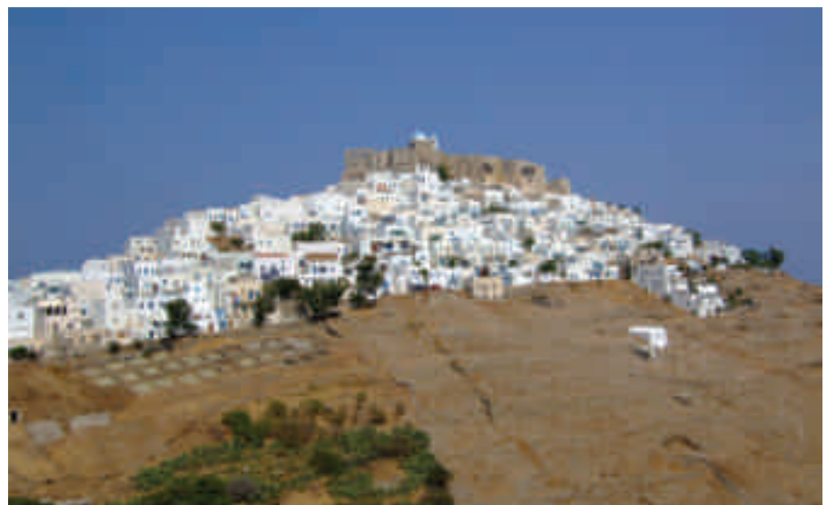
Figure 2 The town of Chora with excavations on its southern slope