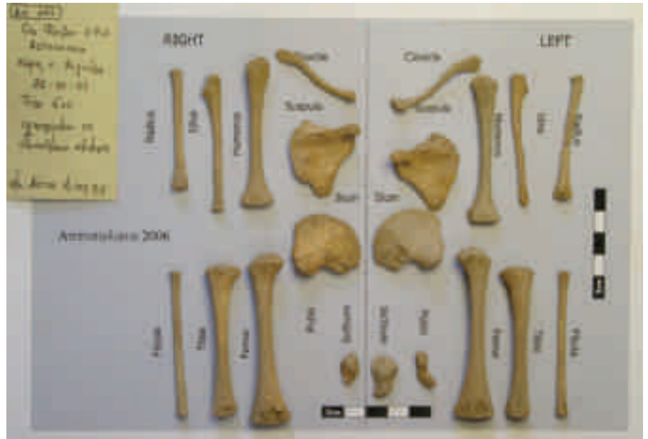
Figure 9 The post-cranial remains of a neonate

It is currently extremely difficult to determine the sex of individual children from their skeletons, as the main distinguishing features do not start to develop until after puberty. A number of previous studies, however have shown some variation between young boys and girls in the shape of the sciatic notch of the ilium. 7 This is currently the subject of a postgraduate student project, using the Kylindra material.