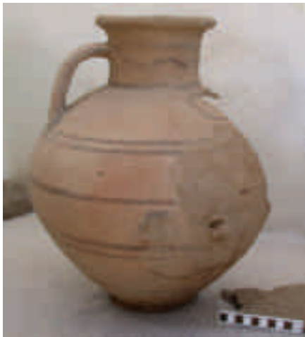
Figure 7 A decorated pot from the Kylindra infant cemetery