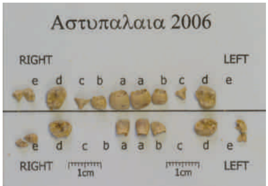
Figure 10 The developing deciduous dentition of a neonate

So far, most of the pots which have been excavated contained a single infant, but in some instances between two and three skeletons were found. Most commonly the second and third skeletons are represented by only a few elements, which frequently occur in pots from the most heavily disturbed areas of the site and most likely represent intrusions. In some cases, however, two almost complete skeletons have been found (Fig. 11). These double burials could either represent the death of two unrelated infants at similar times or the presence of twins. Once again, the prevalence of double burials is about 1.9%, which is similar to figures for the prevalence of twins in modern European women and it is tempting to suppose that the burial is a deliberate attempt to represent the situation at birth. 8