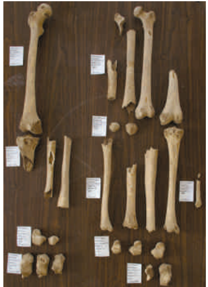
Figure 4 Lower limb bones from Grave 20, Katsalos cemetery representing at least three individuals

Most of the bone fragments retrieved from the graves could be attributed to the part of the skeleton to which they belonged. In addition, some fragments contained information about age at death and sex of the individuals buried within