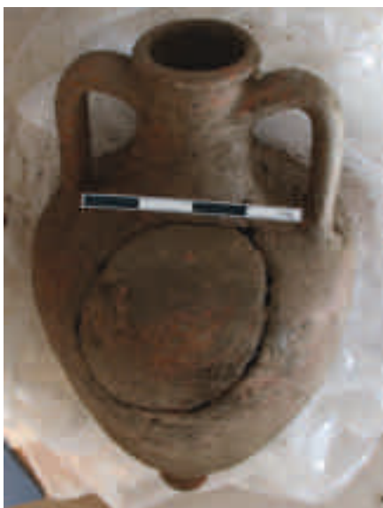
Figure 8 A trade amphora from the Kylindra infant cemetery with a lid cut out of its side to enable a baby to be placed inside

months after birth. 6 The smallest baby to be excavated from the Kylindra cemetery represents, by modern standards, a child of approximately 24 weeks' development in utero. It is extremely unusual to have remains of such small babies preserved on archaeological sites. The remains of a few older children have also been found within the cemetery, with one pot containing the remains of a child showing a stage of development equivalent to a three-year old in terms of modern standards.