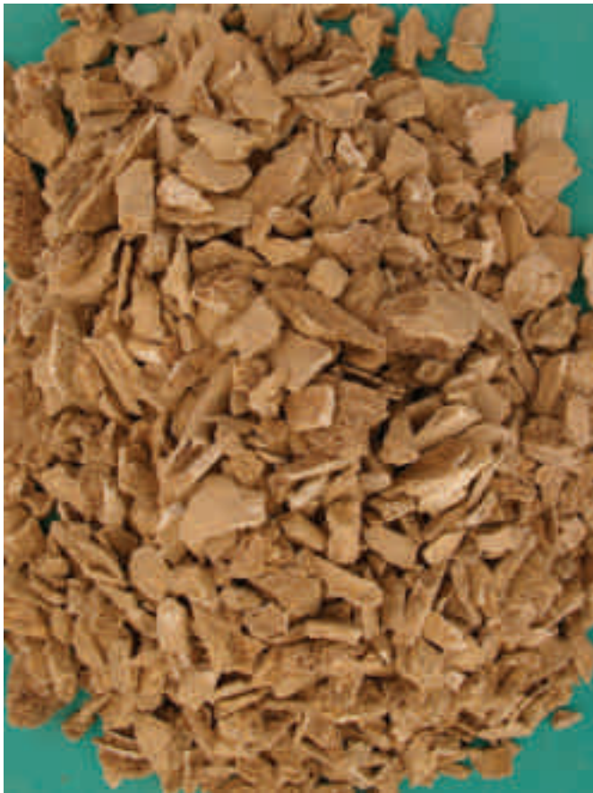
Figure 3 Bone fragments from Grave 3, Katsalos cemetery