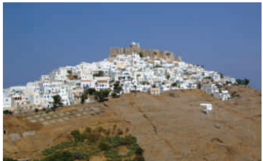
Figure 2 The town of Chora with excavations on its southern slope