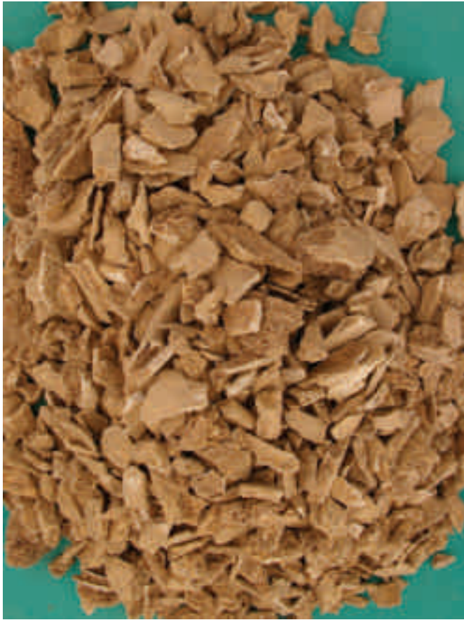
Figure 3 Bone fragments from Grave 3, Katsalos cemetery