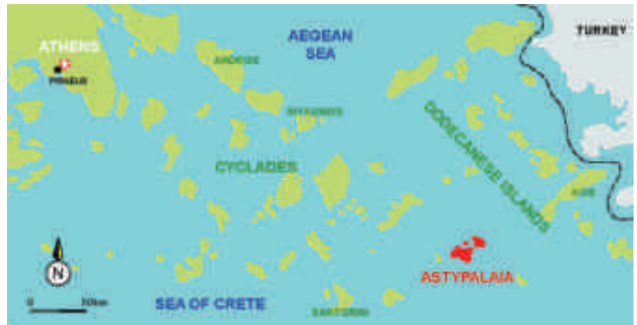
Figure 1 Map showing location of Astypalaia

In 1981 the 22 nd Ephorate of Prehistoric and Classical Antiquities undertook the first excavations on the island, which led to large scale excavations. 2 Two cemeteries, Katsalos and Kylindra, associated with the Classical settlement period on the island, were excavated. The Katsalos cemetery is located on the neighbouring hill to the main town of Chora, with archaeological finds dating its use from the Late Geometric (around 750 BC) until Roman times. Preliminary analysis of the skeletal remains from this cemetery suggests that individuals of all ages were buried there. In contrast the Kylindra cemetery, located on the southwest slope of Chora directly below the Venetian castle, appears to have been reserved for the bodies of newborn babies and a few